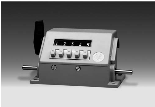
UE230 - Revolution counter