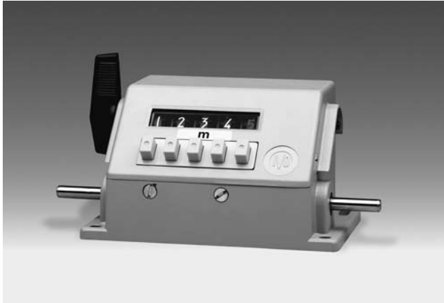
ME230 - Meter counter