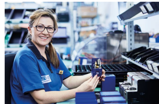
We know how important our UPS systems are for your work. Which is why care is at the top of our list of priorities.

All of this so that we can cope with the challenge of a safe power supply in future too – even in local grids. This is how we secure the lifelines of an increasingly networked world.