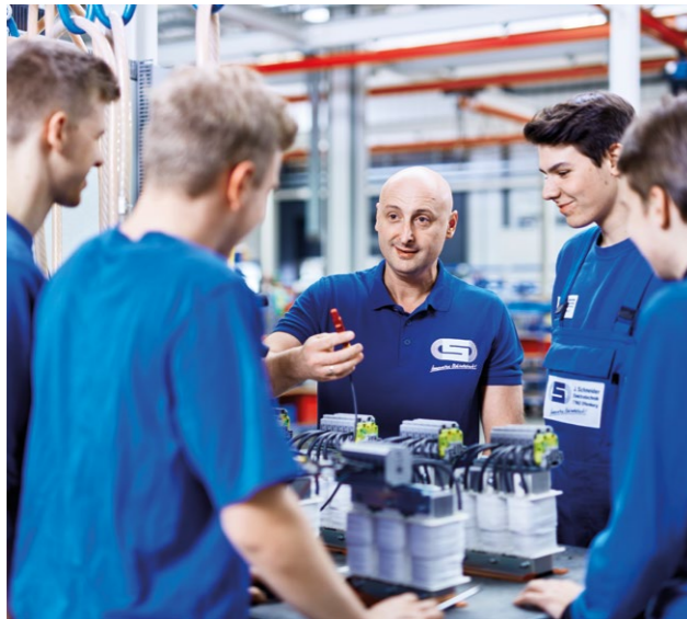
Passing on valuable knowledge – and promoting important talents. This keeps J. Schneider at the cutting edge of technology.

The trainees' and apprentices' own website at www.massgeschneiderte-ausbildung.de illustrates just how important this topic is.